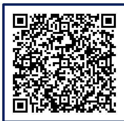
University of Mumbai