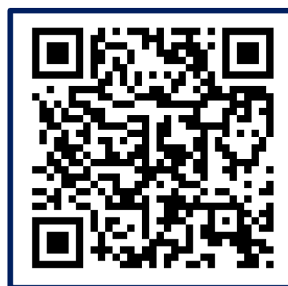
RKT College Website